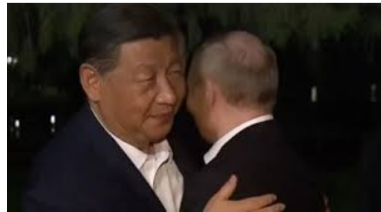
A rare show of affection.

increases on China, which has led to a further deterioration in relations between China and the United States. These two extraordinary developments happening simultaneously are making people wonder: what is the future of Sino-US relations going to be like?