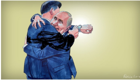
Limits of Friendship

States, and who can really seize the opportunity, win the initiative, reverse or control the development of strategic situations.