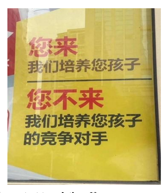
Image text translation: If you come to us, we will train your child. If you don't come to us, we will train your child's competitor

境 Jī diǎn wèi wáng: Zhōngguó dǐngjiān gāoxiào niángīng rén de qiútú kùnjìng), which went viral in my friend circles some time ago says, in top notch universities like Qinghua and Peking, "revealed through the beautiful indicators and nice-looking success is the common predicament that these brightest young people of China are facing: of successfully suppressing growth, of indulging in doing PK with the peers and finding themselves completely worn out amid extreme competition." The involutization centered round grades has caused the loss of real essence of learning. The pursuit of success, the yearning for it, has led to these God's favoured ones ignore true spiritual growth. However, this kind of absurd and helpless reality has its deep realistic plausibility.