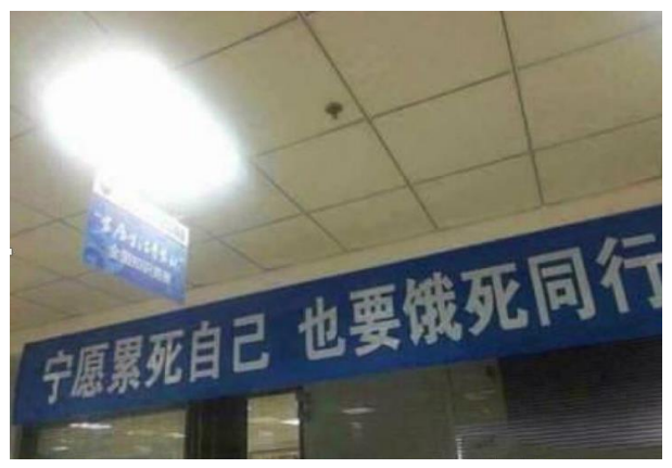
Image text translation: I would rather tire myself to death, but I will not let my colleagues live

"struggle-porn star". To sum it up with an even more vivid sentence, they are those who believe that "I would rather exhaust myself to death, but I will not let my colleagues live". Words like diligence, hard work, and struggle have had positive connotation in traditional Chinese concept. However, in this highly involutized game, the excessive diligence of the individual being evoked out of personal interest, is leading to others being pushed into infinitely deteriorating environment. "Involuted King" or "Struggle-Porn Star", are the vocabularies of criticism borne out of this kind of discourse where individual struggle is criticised.