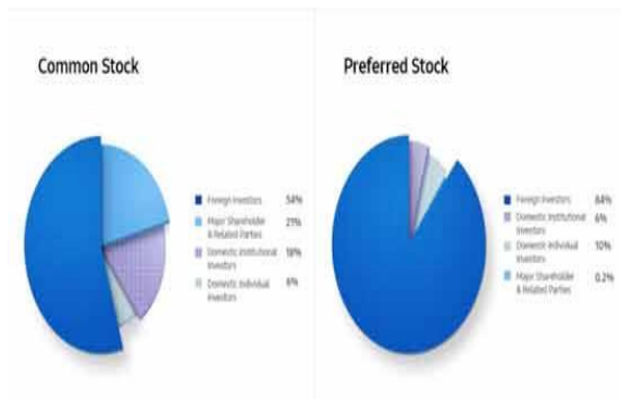
Image: Samsung Electronics shareholding structure in Q2 in the year 2020

Ever heard of capital begetting wealth or making money lying down? Well, it is hard to think about it easily. On the other hand, toiling hard to get rich, adhering to the routine of “996” day in and day out is also naturally tiresome. ( Translator’s note: “996” working hour system is commonly practised by some companies in China. It envisages that employees work from 9:00am to 9:00pm, 6 days a week.)