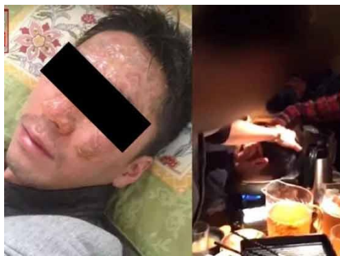
Image: Photo of the employee whose boss forcefully put his head twice in hot pot

And the employee did not dare to sue his boss until he resigned three years down the line.