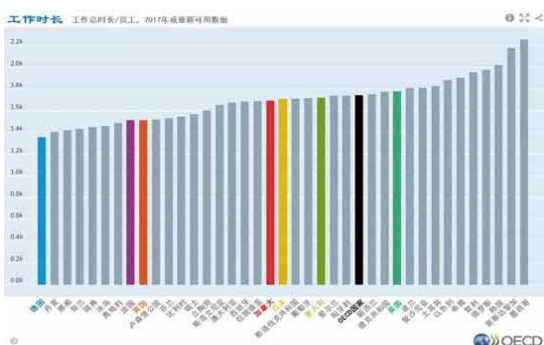
Country-wise working hours table

Japanese employees do not seem to work long hours; their working hours are even less than those of their counterparts in Italy and the United States respectively. In fact, Japan's data is greatly underestimated, because the overtime hours of many employees of private enterprises are not counted.