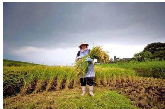
Image: A Japanese woman is harvesting grain

Take the example of South Korea; as early as in 2015, its food self-sufficiency rate, including grains used as fodder, had fallen to 24%, which was the lowest among OECD member countries.