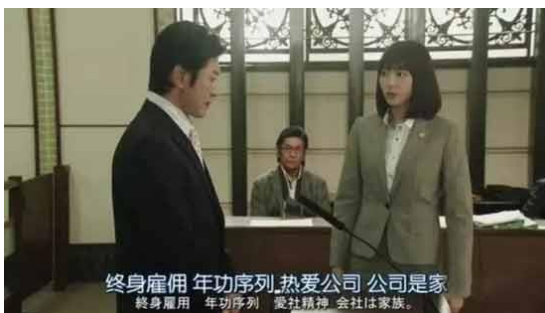
Japan: “Life-long employment, annual work array; company loyalty, workplace is home”

Although Japan's lifelong or permanent employment system has already crumbled, the employees' dependence on the employers still far outweighs the employers demand on the employees. In many cases, Japanese employees are just like an accessory to the leadership.