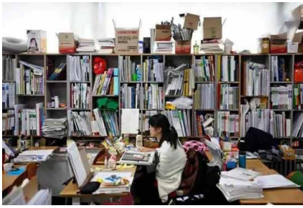
Image: A South Korean student just before taking the college entrance examination

on the ground of “misusing company property.”