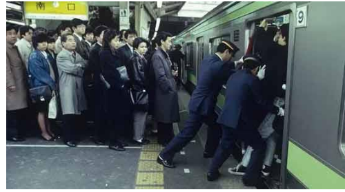
Image: A subway scene at the peak of rush hour in Japan

For Western European countries like Britain, France and Germany, or Northern European countries such as Norway and Denmark, life is more often than not carefree and leisurely. It is not that these countries are not developed. In fact, they are also equally developed, yet they are markedly different, too. It is just like two people with the same annual income of say two hundred thousand bucks, in the end one of whom becoming tired and down with overwork and the other lying down leisurely at home counting his fortunes.