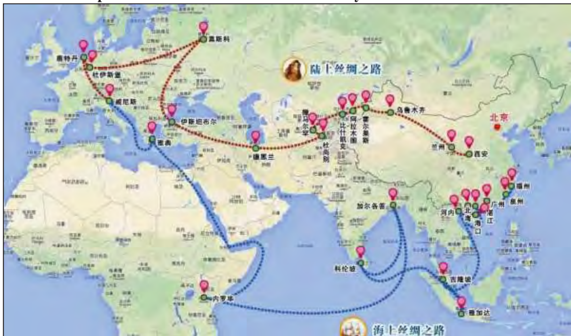
Map I: The New Silk Road and 21 st Century Maritime Silk Route

Most countries in South Asia have welcomed these Chinese initiatives but India has been reticent ( The Times of India 2014). Many observers in India see these initiatives as a Chinese attempt to further its expansionist agenda in the wider Indo-Pacific region and to achieve a strategic encirclement of India in South Asia (Sibal 2014; Tharoor 2014). Though India's relations with China have witnessed an incremental improvement in the last decade, with both countries working together on various platforms, including the recently established Asian Infrastructure Investment Bank (Subramanya 2015; The Economic Times 2015), contentious bilateral issues such as the border dispute remain unresolved. India is also deeply suspicious regarding China's relations with Pakistan, which in its opinion, are aimed at containing India.