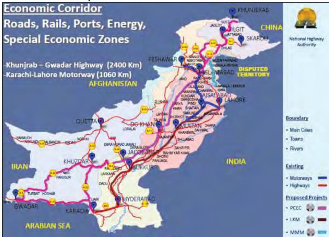
Map II: The Pakistan China Economic Corridor