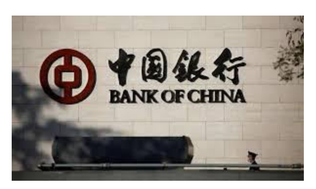
Bank of China