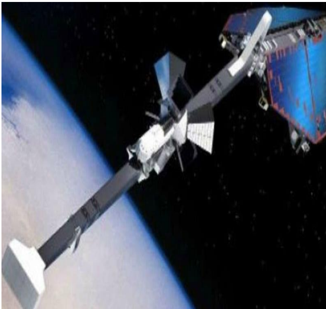
Image: Micius is the world's first quantum communication satellite