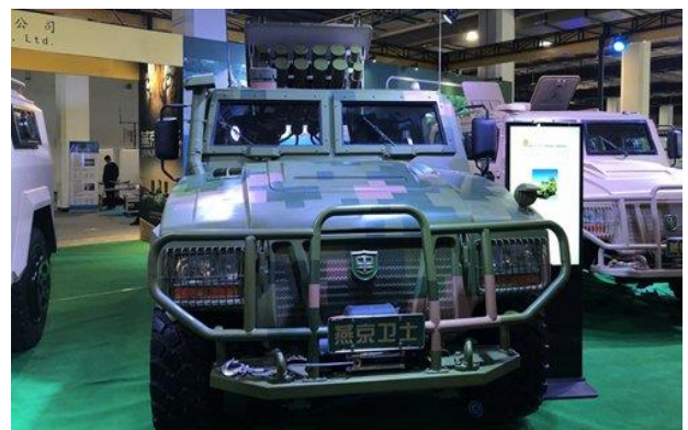
Image: A multipurpose drone launching armored vehicle developed by Yanjing Auto is displayed at Beijing Civil-Military Integration Expo 2019

On 1 May 2019, during the Labour Day celebrations, China flew 1374 Ehang drones and created a world record. They are also trying out an armoured vehicle capable of launching 12 drones (Xuanzun, 2019).