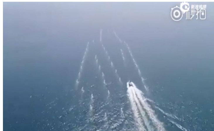
Image: A 56-boat drone swarm by Yunzhou-Tech makes the shape of China's aircraft carrier.