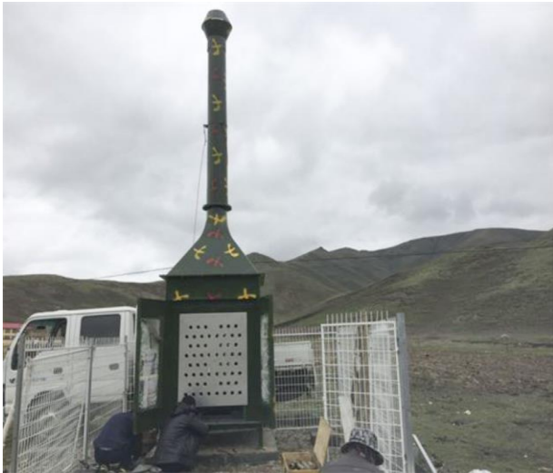
Image: One of the fuel-burning chambers that have been deployed on the Tibetan plateau.